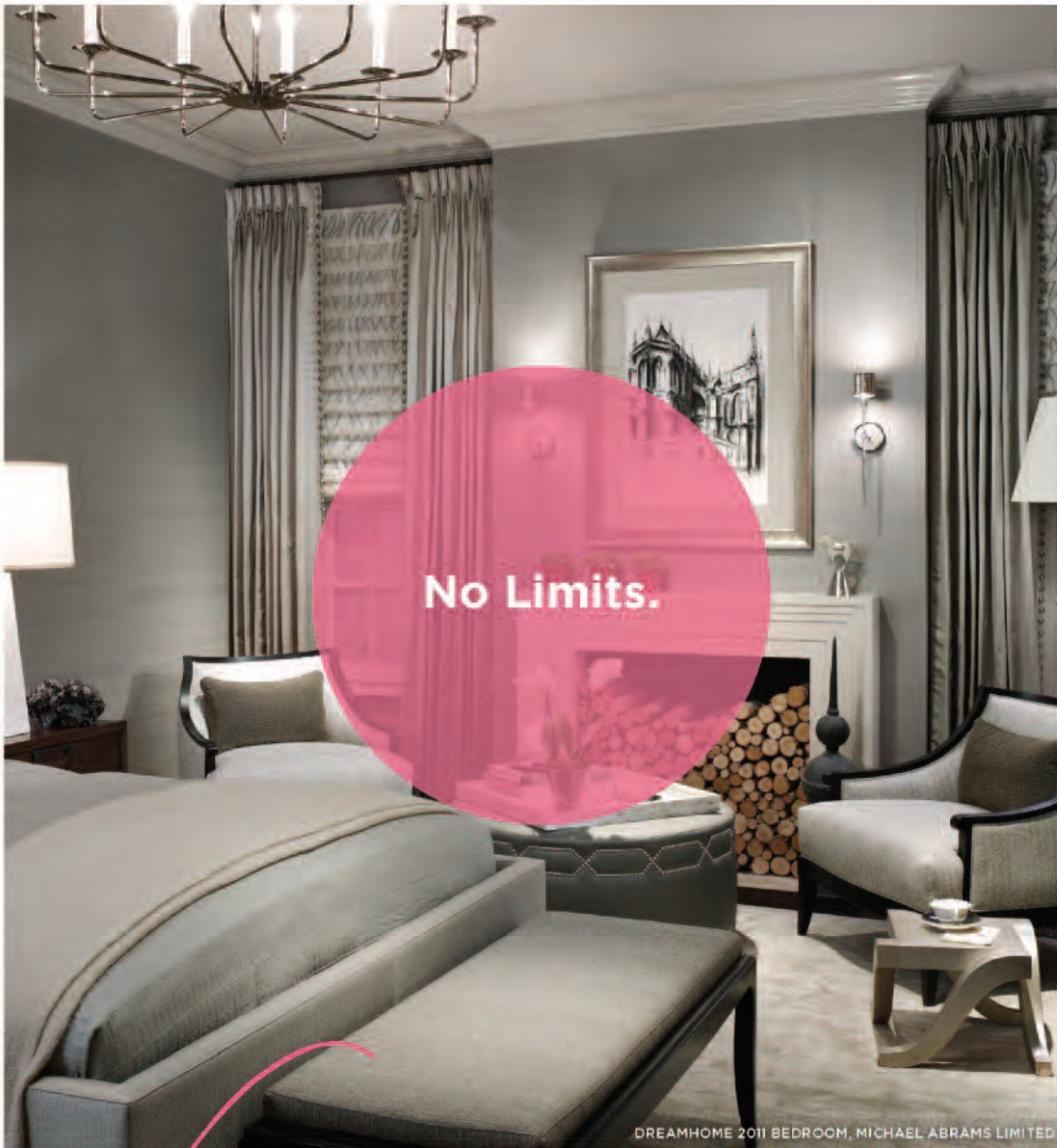
DREAMHOME 2011 BEDROOM, MICHAEL ABRAMS LIMITED