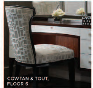
COWTAN & TOUT, FLOOR 6