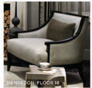
HENREDON, FLOOR 18